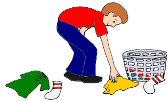
Pick Up Clothes

Instructions: Cut out the dice. For stronger, longer lasting dice, stick or print onto card stock. Fold along the inside lines, and make into a cube with the flaps on the inside. Glue or tape together to secure.